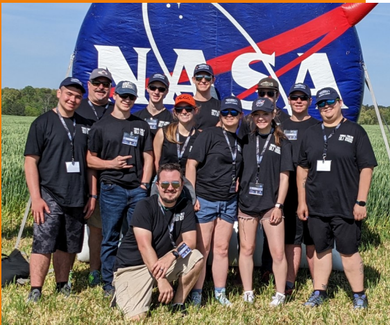
2022 NASA Student Launch Team in Huntsville, AL

If you or someone you know might be interested in supporting our program, please don't hesitate to reach out. Your support brings a world class experience to YC students, placing them at the bleeding edge of STEM Education in America.